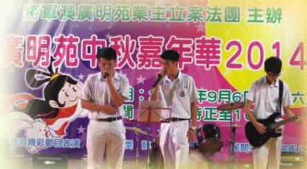
The Band were invited to perform in the 2014 Mid-Autumn Festival Carnival in Kwong Ming Court.