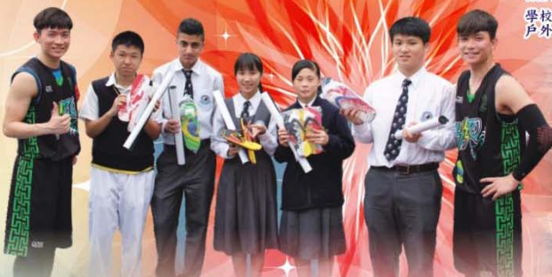
The Celebrities Basketball Team came again! They had a friendly match with the teachers and students and gave gifts. It was great fun indeed!