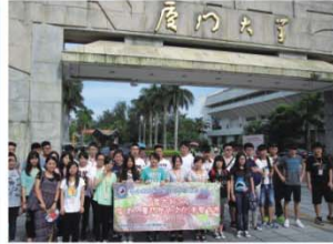
Students found the trip to the Xiamen University rewarding. 參觀廈門大學，獲益良多。