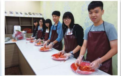
All students were busy making their own kimchi. 不論男女生，一齊動手製作韓國泡菜！