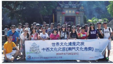
A-ma Temple filled with the smell of incense is a symbol of the Chinese culture prevailing in Macau over a long period of time. 香火鼎盛之媽閣廟見證中國文化在澳門薪火相傳。