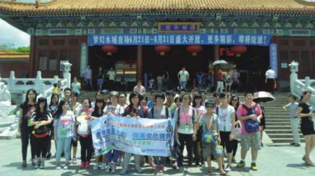
Students visited the New Yuan Ming Palace and learnt about the royal families' life in Ming and Qing Dynasty.