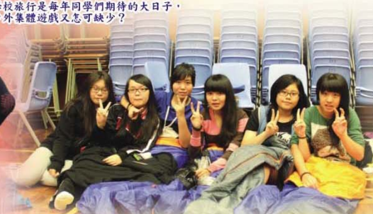
How wonderful would it be to camp in school hall with your friends! Our leadership camp finally granted our students the seemingly impossible wish.