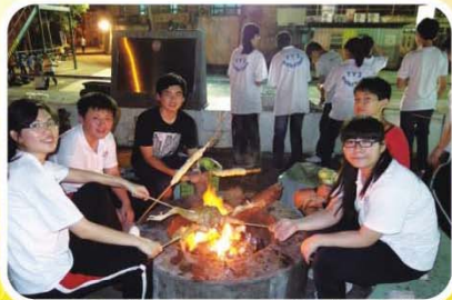
To be a student leader, one must attend the leadership training camp first. The Campfire is the most remarkable activity.

本校節奏口技班獲西貢區民政事務處邀請，代表西貢區參與慶祝國慶65周年——全港青少年藝能大比拼。