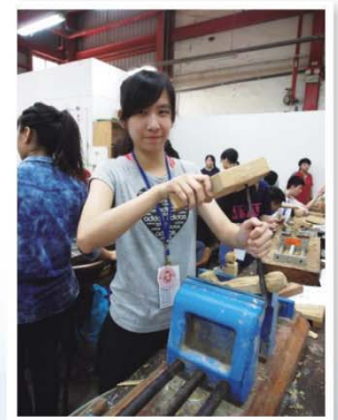
The students enjoyed making creative woodcarving. 同學親身體驗製作創意木雕的樂趣。