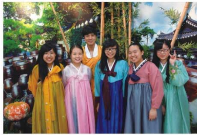
How can you not try on the traditional Hanbok as we are there? 來到韓國，怎能不試穿一下傳統的韓服呢？