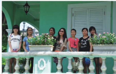
Students visiting the Taipa Houses Museum and learn about the life of the Portuguese in Macau in the past. 參觀龍環葡韻，同學體驗當年葡人在澳門的生活。