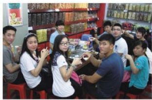
Xiamen is famous for the finest quality Da Hong Pao. Let's taste it! 齊來品茗！廈門特產，頂級大紅袍！

師生一行三十三人有機會到訪世界文化遺產之一——福建土樓，認識獨特的建築特色及閩南的傳統文化。另外亦考察有「海上花園」之稱的廈門及「海上絲綢之路起點」——泉州，期間拜訪廈門大學，並進行交流。最後前往「海上花園」——鼓浪嶼考察，獲益良多！