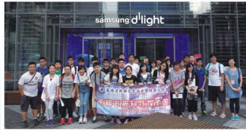
The students and teachers took a photo in front of the Samsung D'Light Exhibition. 一行人在世界知名科技品牌Samsung D' Light 展示館前留影！

行程中同學有機會到訪Samsung D' Light 展示館及KBS韓國放送公社，見識了南韓嶄新的科技。而同學亦有機會到訪景福宮及南大門觀察當地旅遊業運作。旅程中同學更有機會親手製作泡菜並試穿傳統韓服，體驗大韓文化，大開眼界！