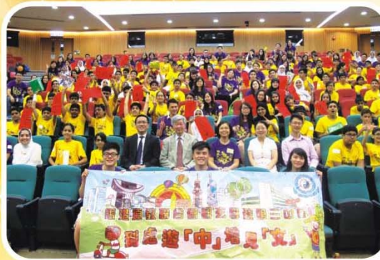
The Chinese Language Department led foreign students to the Hong Kong Institute of Education for the Chinese Language Learning Day Camp.

中文科帶領外籍同學到香港教育學院進行「到處遊「中」增見「文」計劃——中文學習日營」。