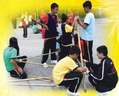
The S1 students joined the Adventure Camp, built up their confidence and learnt team spirit.