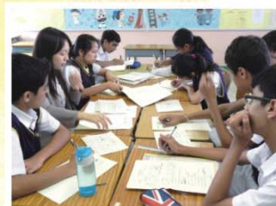
The Enhancement Programs on Chinese Language, English Language, and Mathematics would greatly improve the students' results. 「中英數能力提升計劃」大大提升同學的成績。

Moreover, the subsidy covers activities such as the Fun Learning Workshop, the Enhancement Programs on Chinese Language, English Language, and Mathematics, and the Oral Classes on Chinese Language and English Language, meeting the diverse learning needs. It also covers a range of leadership building activities such as the Moral Education Enhancement Program, the Adventure-based Leadership Training Camp, the Perfect Training Camp, and the Endurance Training Camp, which would include war games, hiking, and adventure-based training. The school is grateful to WHARF for its assistance in improving the comprehensive performance of students.