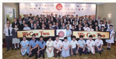
Our school is one of the 14 schools in HK supported by the project. 本校是今年全港14間入選計劃的學校之一。

The school is pleased to receive around $900,000 subsidy from WHARF "Project We Can 2" to implement various projects and activities this and next academic year. These activities include a visual arts program called "Arts on a Tablet" and procurement of iPad Air and the related graphic design applications. Students would be enabled to study with the advanced tablets in different environments, making learning more interesting and efficient.