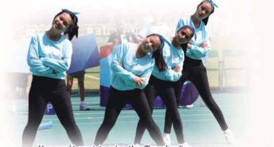
You won't want to miss the Cheerleading Competition in Sports Day!