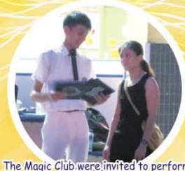
The Magic Club were invited to perform in the Mid-Autumn Festival Evening Party in Yan Oi Tong Tin Ka Ping Primary School.