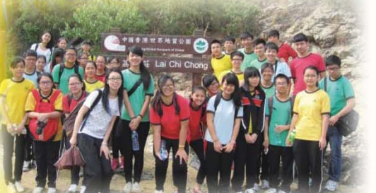
The Hong Kong Geopark, home to world-class geological features, is a suitable place to learn Geography.