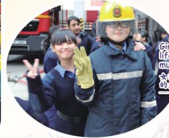
Girls may experience the life of fire fighters in our multi-intelligence camp.

中文科帶領外籍同學到香港教育學院進行「到處遊「中」增見「文」計劃——中文學習日營」。