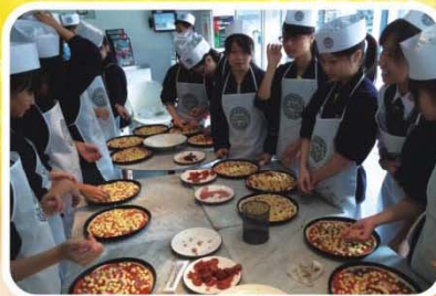
You may have pizzas very often but it was indeed a very rare chance where you could make your own pizza in Pizza Express.

Pizza常常吃，但進入Pizza Express親手製作Pizza就機會難逢。