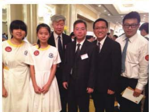
Principal, teachers and students participated in the kick-off ceremony of WHARF "Project We Can". 校長師生出席九龍倉集團「學校起動計劃」啟動禮。