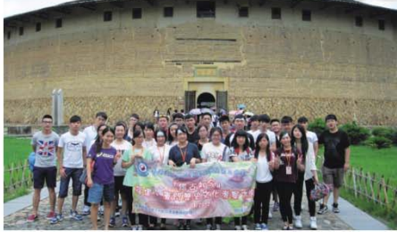
Students visiting Hua'an Tulou, a World Heritage. 同學有機會一睹世界文化遺產「華安土樓」。

The Chinese History Department organized the Historical and Cultural Study Trip to Fujian and Xiamen from 26 June to 29 June 2014. Students took the chance to know more about the culture and history of China. They also learnt about the latest development in economy and education in mainland China.