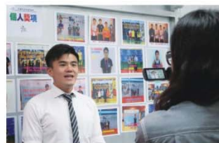
The achievement of Mr. Wong attracted the press from The "Schoolike" of Hong Kong Federation of Youth Groups to cover. 黃老師的成就亦吸引青協「讚好校園」記者到校採訪。

我的校園教學哲學是「嚴而有愛」，讓學生感受到我對他們是有要求、有期望的，或許初接觸我的同學會覺得我要求高，但我亦會慢慢讓他們知道，他們的付出是有回報的、是值得的。因此我與學生的關係不太像朋友，或許有點像父親與子女，一個嚴而有愛的父親。