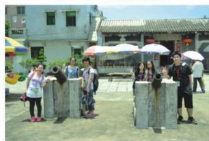
Students took a photo with a cannon guarding China in Opium Wars on Baishi Street. 同學在白石街與曾在中英鴉片戰爭中肩負保家衛國的大炮合照。

The Guidance Department organized the Cultural Study Trip to Zhuhai and Macau from 26 June to 28 June 2014. Students visited Qi'ao Island in Zhuhai and the Baishi Street, a Patriotic Education Base, where they reviewed the Opium Wars. They also visited the New Yuan Ming Palace and learnt about the traditional Chinese culture. In Macau, students broadened their horizons by visiting different cultural landmarks in various eras, such as the Chapel of Our Lady of Penha, the Maritime Museum, and the Grand Prix Museum.