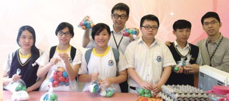
The PTA has been sponsoring the warm "Chinese Red Eggs for Birthday Boys and Girls Project" for many years.