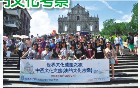
Students took photos in front of Ruins of St. Paul's. 澳門大三巴牌坊，又怎可以不留影！