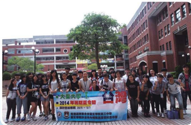
The students got a chance to visit the Da Yeh University and experience a university student's life. 同學有機會到訪台灣大葉大學，體驗大學生的生活。

旅程中同學有機會學習製作創意木雕，體驗製作數位動畫，參觀台灣玻璃藝術館，大大增加同學的藝術修養。另外，同學更有機會到訪逢甲夜市，品嚐台灣地道小食。同學皆表示很享受及珍惜這次旅居外地學習的經歷。