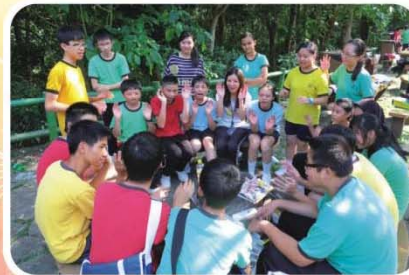
The outdoor activities are an indispensable part of the school excursion?

Pizza常常吃，但進入Pizza Express親手製作Pizza就機會難逢。