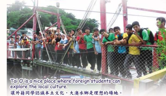
Tai O is a nice place where foreign students can explore the local culture.