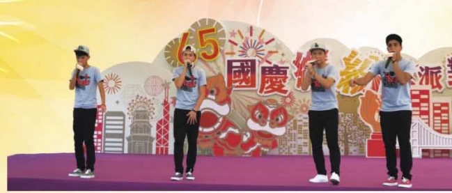
The Beatbox Class was invited by the Sai Kung District Home Affairs Department to participate in the Hong Kong Youth Talent Competition in Celebration of 65th Anniversary of the PRC as a representative of Sai Kung District.

本校節奏口技班獲西貢區民政事務處邀請，代表西貢區參與慶祝國慶65周年——全港青少年藝能大比拼。