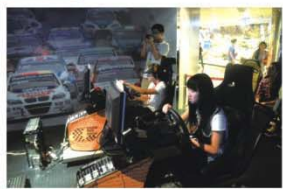
Students had a feel of car racing in the Grand Prix Museum. 來到澳門格蘭披治大賽車博物館，一定要親身體驗何謂賽車。