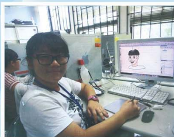
Students got chances to make digital animations. 同學有機會製作數位動畫。