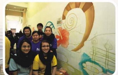
Everyone can decorate the campus by painting big murals.