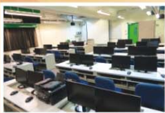
Multi-Media Learning Centre 多媒體學習中心

經過多年的發展，本校各類型資訊科技設備已發展得十分完善。設備全面電腦化，除設三個電腦室外，不同科目包括視覺藝術及設計與科技等已設電腦學習室。現時全校有超過360部電腦，讓師生隨時隨地透過資訊科技學習。