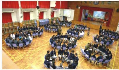
▲ In Mentorship Talks, senior executives and professionals from large-scale organizations are invited to share their experiences with all 5.6 students.

星級導師們分享他們如何從波折的奮鬥歷程中汲取經驗，協助學生尋找人生的目標及方向。