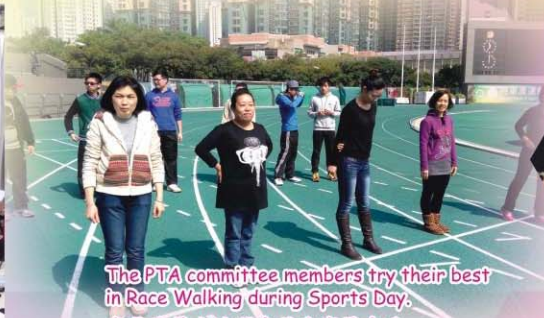
The PTA committee members try their best in Race Walking during Sports Day. 家長委員在陸運會競步賽展身手。