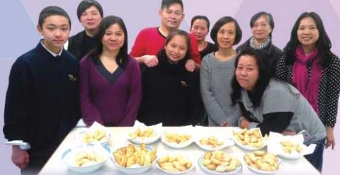
Let's cook together in the Chinese Lunar New Year snack making class! 新春小食製作班，齊齊來下廚！