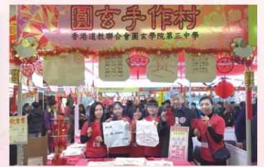
▲ Students participate in Young Innovators Bazaar and learn to run a business by being responsible for the product idea, design and manufacturing, as well as operation and promotion.

參加「趁墟做老闆」活動，學生負責產品的構思、設計、製作、營運及宣傳，希望能從中學習如何經營一盤生意。