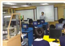
Graphic Design and Technology Room 圖像設計科技創作室