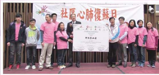
▲ The PTA actively participates in Community CPR Day held by Tseung Kwan O Hospital. 家教會積極參與將軍澳醫院「社區心肺復蘇日」。