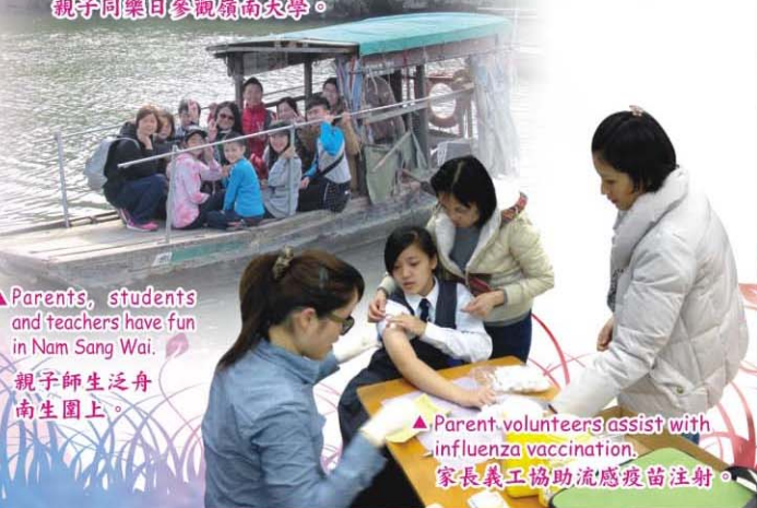
▲ Parents, students and teachers have fun in Nam Sang Wai. 親子師生泛舟南生圍上。