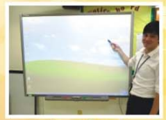
Smart Board 電子白板