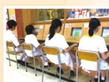
Computer Station 電腦資訊站