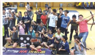
▲ During the discipline training program, students learn team-working through participating in Archery Tag.

The above activities are being launched. We will continue to have the support from Project WeCan 2 this year. Successful in applying for Partnership Fund for the Disadvantaged offered by Social Welfare Department, we have also obtained a $490,000 extra grant. With the abundant resources, our students will be enabled to join more activities and broaden their horizons.