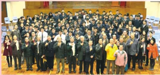
▲ The "Star Mentors" share how they have gained experience by striving in their life. This helps students to find out their goals in life.

星級導師們分享他們如何從波折的奮鬥歷程中汲取經驗，協助學生尋找人生的目標及方向。