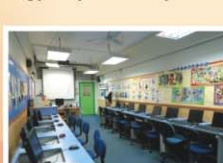
Computerized Art Room 電腦美術創作室