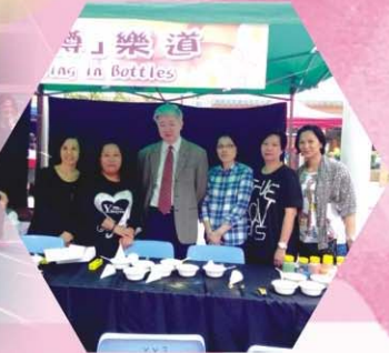
The PTA runs a booth in Community Service Day. 家教會設攤位，全力支持學校社區服務日。