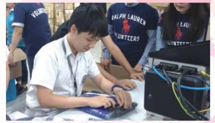
▲ Students broaden their horizons through visits to different places, such as Lane Crawford, Harbour City, and Ralph Lauren's warehouse and flagship store.

舉辦「『商識』伴我行」星級講座，邀請多位大型機構的高層人員及專業人士到校與全級中六學生分享。