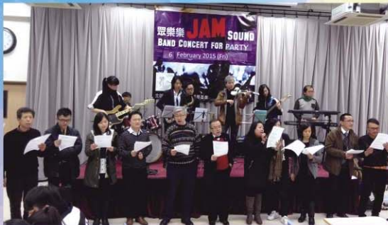
▲ Parents and teachers sing together in Jam Sound Band Concert! 在眾樂樂Jam Sound演唱會中，家校同心，一同高歌！