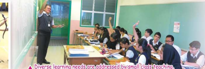
▲ Diverse learning needs are addressed by small class teaching, such as "Enhancement Class for Chinese, English and Mathematics" and "Oral Chinese and English Class".

安排共160名師生欣賞勵志電影《爭氣》。透過劇中主角的奮鬥故事，讓學生們學習堅毅及待人處事的應有態度。