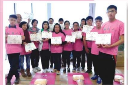
▲ Parents and students are awarded CPR certificates together. 親子齊齊獲頒心肺復蘇法證書。

It has been the 16 th year since the establishment of the YY3 PTA. The PTA has been offering a variety of fun activities as usual. The most special activity should be the Community CPR Day arranged with regard to the 15 th Anniversary of Tseung Kwan O Hospital. Around 300 participants from Tseung Kwan O, including our parents and students, together learned CPR, understood more about health, and achieved a certificate.