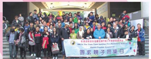
▲ Parents and students visit Lingnan University in Family Fun Day. 親子同樂日參觀嶺南大學。

此外，於學校社區服務日中，家教會的攤位每次都大受歡迎。今年，家委們仍然熱衷於參加校內的活動，陸運會的競步賽仍是那麼激烈。「眾樂樂JAM SOUND大派對」中更和校長及嘉賓們一起高歌。「家校樂融融」的精神總是滿溢於校園每一個角落。