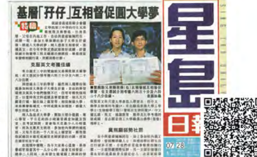
Sing Tao Daily 星島日報