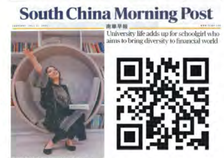
South China Morning Post 南華早報