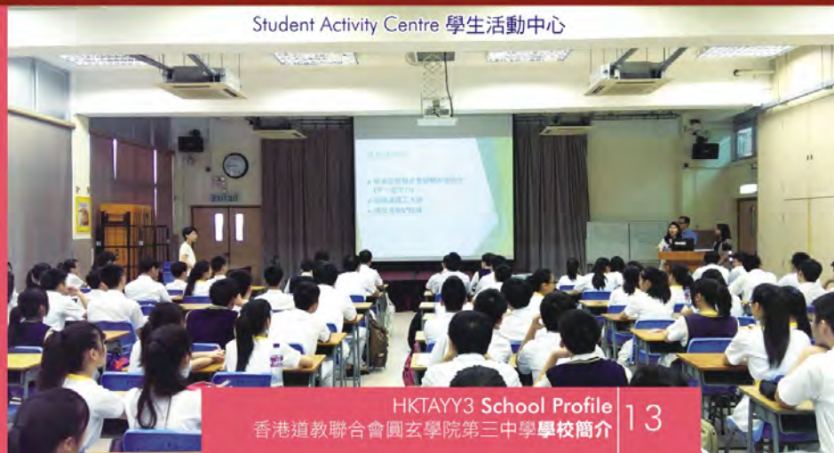
Student Activity Centre 學生活動中心