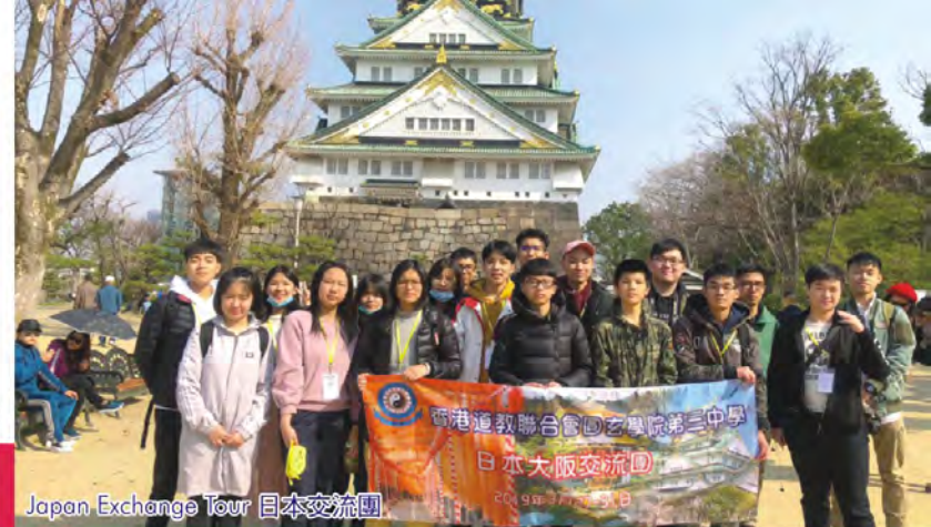
Japan Exchange Tour 日本交流團