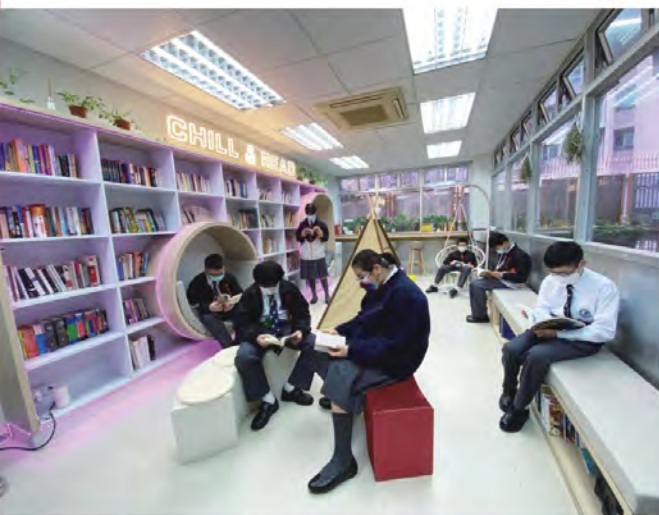
Wisdom Reading Room 明道書室