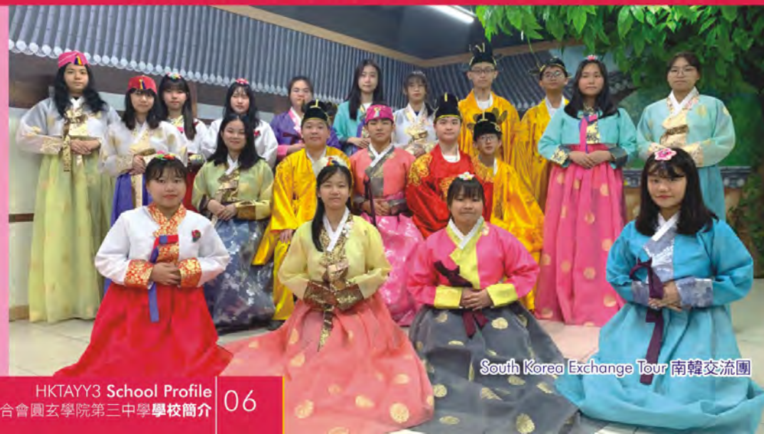
South Korea Exchange Tour 南韓交流團