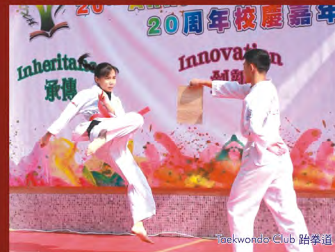
Taekwondo Club 跆拳道