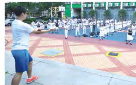
Tai Chi Practice 強身健體太極操