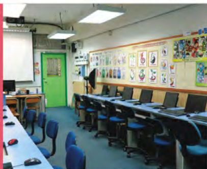
Computerized Art Room 電腦美術創作室