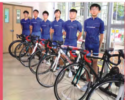
Cycling Training Centre 單車訓練中心