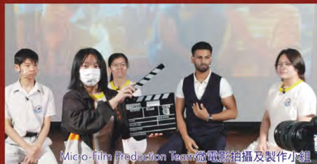
Micro-Film Production Team 微電影拍攝及製作小組