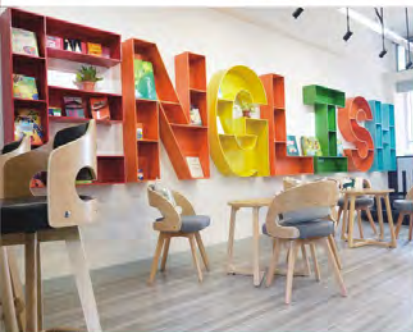
English Corner 英語角