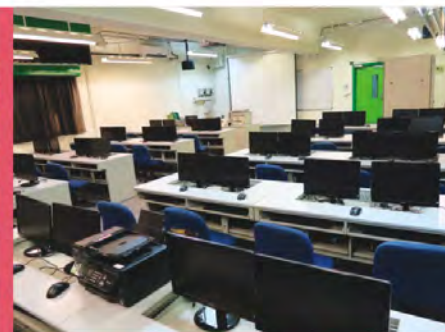
Multi-Media Learning Centre 多媒體學習中心