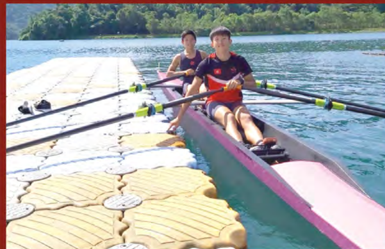
Rowing Team 划艇隊