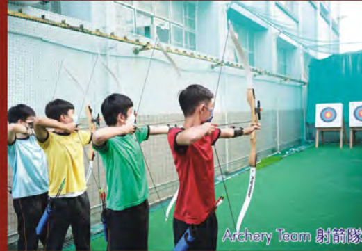
Archery Team 射箭隊

為配合新高中學制下的「其他學習經歷」，全面推行「活動課」，逢星期五下午舉行，讓同學專心發展個人興趣及潛能。全年開設學會及興趣小組近50個。其中如雜耍班、流行樂隊等屢獲殊榮，曾獲多間電子傳媒採訪。各個活動學會及團隊多次獲外間不同機構及小學邀請表演及服務，增加同學自信及與人溝通的技巧。