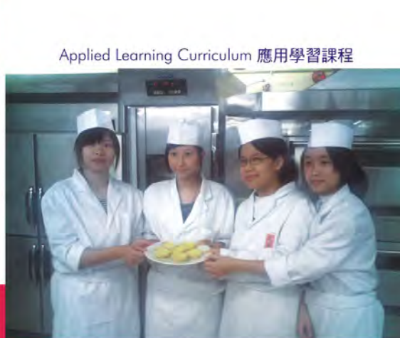
Applied Learning Curriculum 應用學習課程