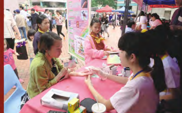
Community Service Day 社區服務日