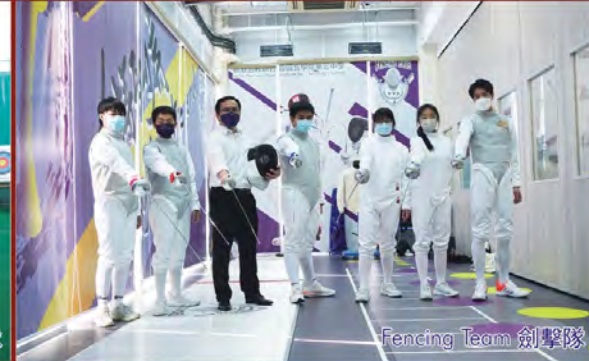
Fencing Team 劍擊隊