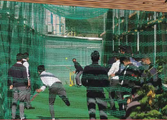
"The Shot" Practice Net 善擊場