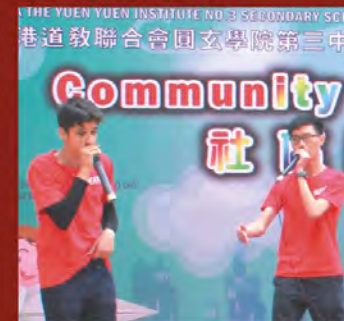
Beatbox Class 節奏口技班