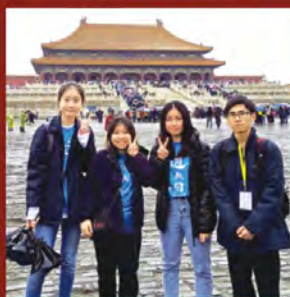
Kazakhstan Tour 哈薩克考察團