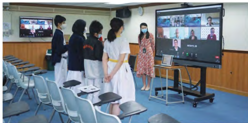
Distance Learning Classroom 遙距教室