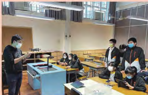
Drone Programming 無人機編程

自訂與STEM相關的課程及編寫教材，透過不同有趣的活動，有系統地提升中一及中二級同學協作、解難、傳意、分析及自學等能力。