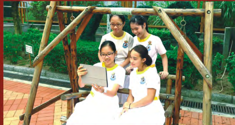
Wireless Network Wi-Fi and Tablet Computers Wi-Fi無線網絡及平板電腦