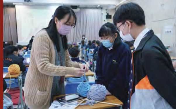
Life Ambassador Scheme 生命大使計劃