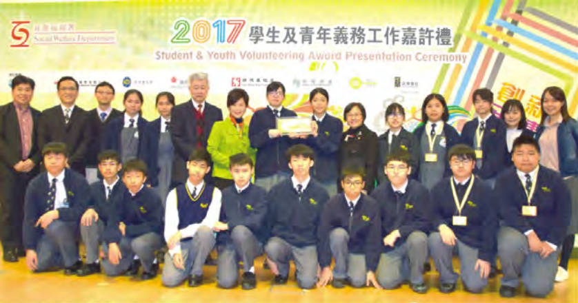
2017 學生及青年義務工作嘉許禮 Student & Youth Volunteering Award Presentation Ceremony