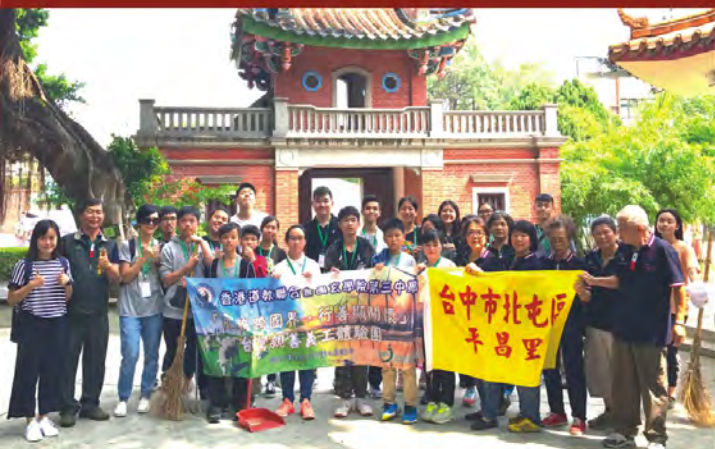
Voluntary Service Experiential Tour of Taiwan 台灣親善義工體驗之旅