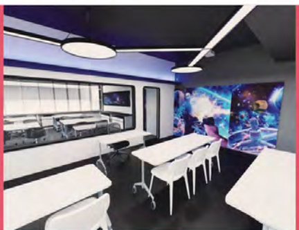
i-Maker Studio 玄創坊