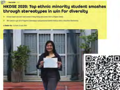
South China Morning Post 南華早報