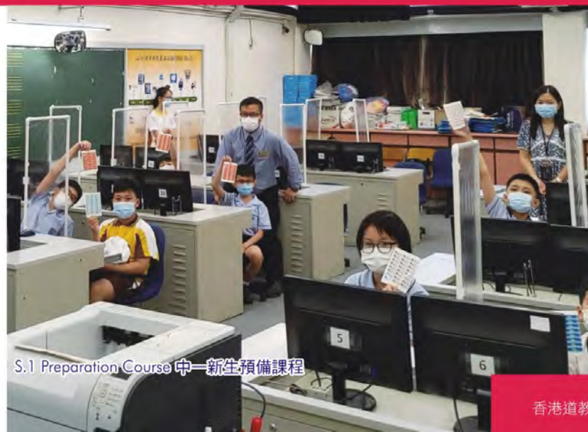
S.1 Preparation Course 中一新生預備課程

每年舉辦多個不同的國內及國外遊學團，如「悉尼之旅」、「英國之旅」、「南韓之旅」、「馬來西亞之旅」、「新加坡之旅」、「北京之旅」、「海南之旅」等，擴闊同學視野。