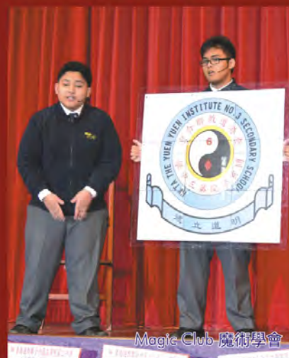
Magic Club 魔術學會