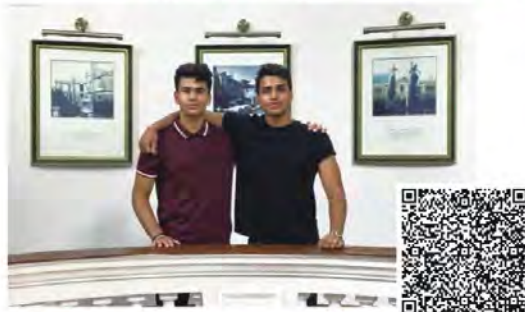
Hong Kong Economic Times 經濟日報

The University of Hong Kong Bachelor of Business Administration in Accounting and Finance 香港大學工商管理學士(會計及財務)