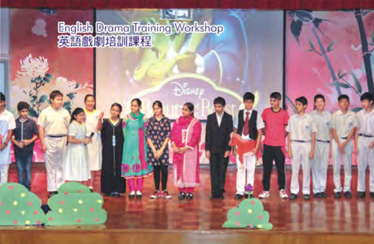
English Drama Training Workshop 英語戲劇培訓課程