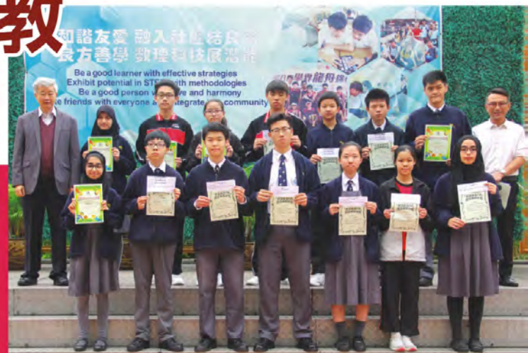
Reading with Fun Programme 悅讀越多FUN計劃