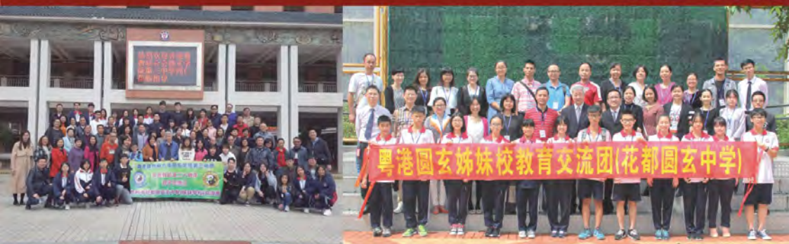
Greeting our Sister School — Guangzhou Huadu Yuen Yuen Secondary School 接待姐妹學校——廣州花都圓玄中學