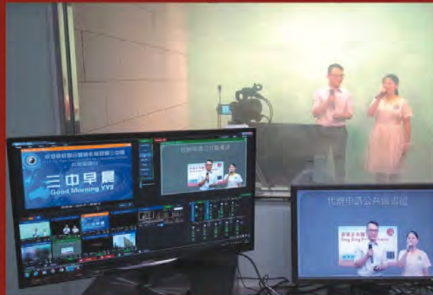
Campus TV 校園電視台