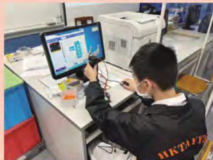
AI Robotic arm 人工智能機械臂