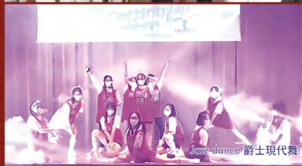
Jazz dance 爵士現代舞