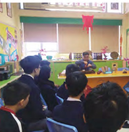
Chinese Corner 中文閣