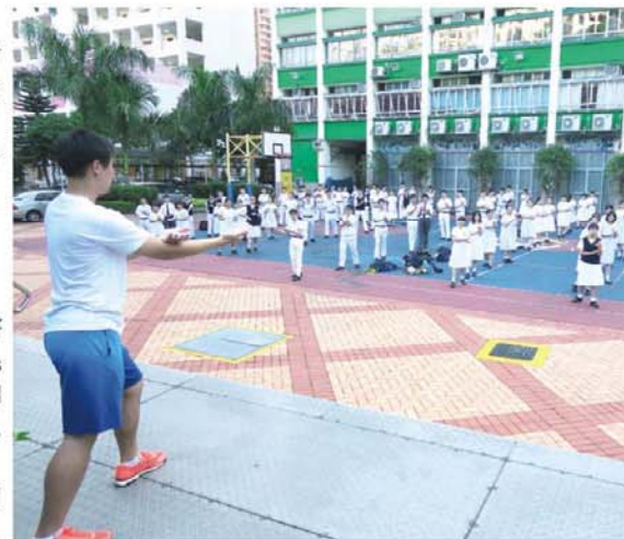
Tai Chi Practice 強身健體太極操

與香港科技大學理學院進行伙伴協作，舉辦不同活動及課程，加強學生在STEM (Science科學、Technology科技、Engineering工程及Mathematics數學) 教育方面的知識及應用。