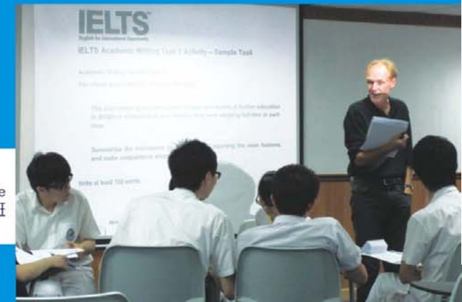
IELTS Training Course 雅思(國際英語水平測試)訓練班