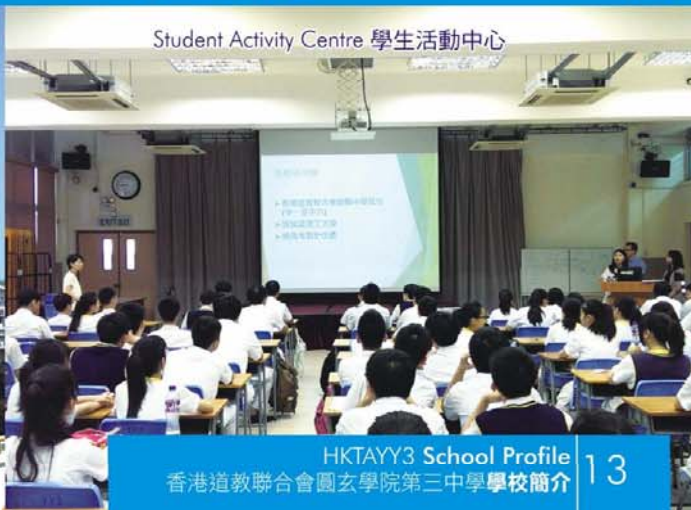
Student Activity Centre 學生活動中心