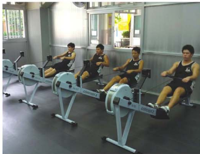
East Kowloon Indoor Rowing Training Centre 九龍東室內賽艇訓練中心