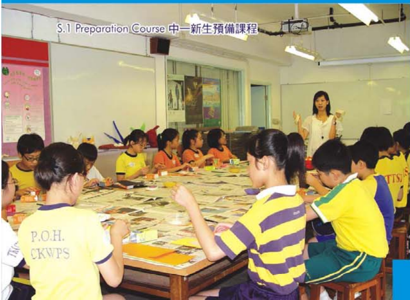
S.1 Preparation Course 中一新生預備課程

每年舉辦多個不同的國內及國外遊學團，如「悉尼之旅」、「英國之旅」、「南韓之旅」、「馬來西亞之旅」、「新加坡之旅」、「北京之旅」等，擴闊同學視野。