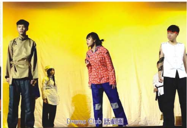
Drama Club 話劇團