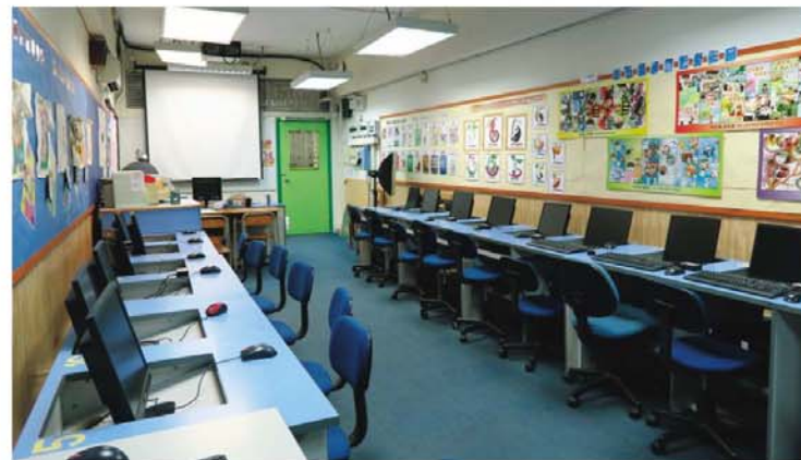
Computerized Art Room 電腦美術創作室