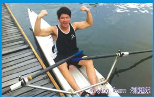
Rowing Team 划艇隊