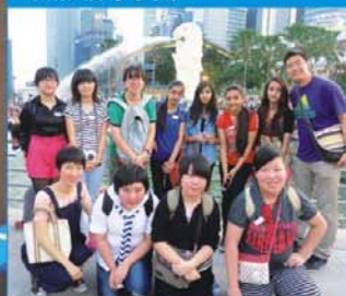
Singapore Tour 新加坡考察團