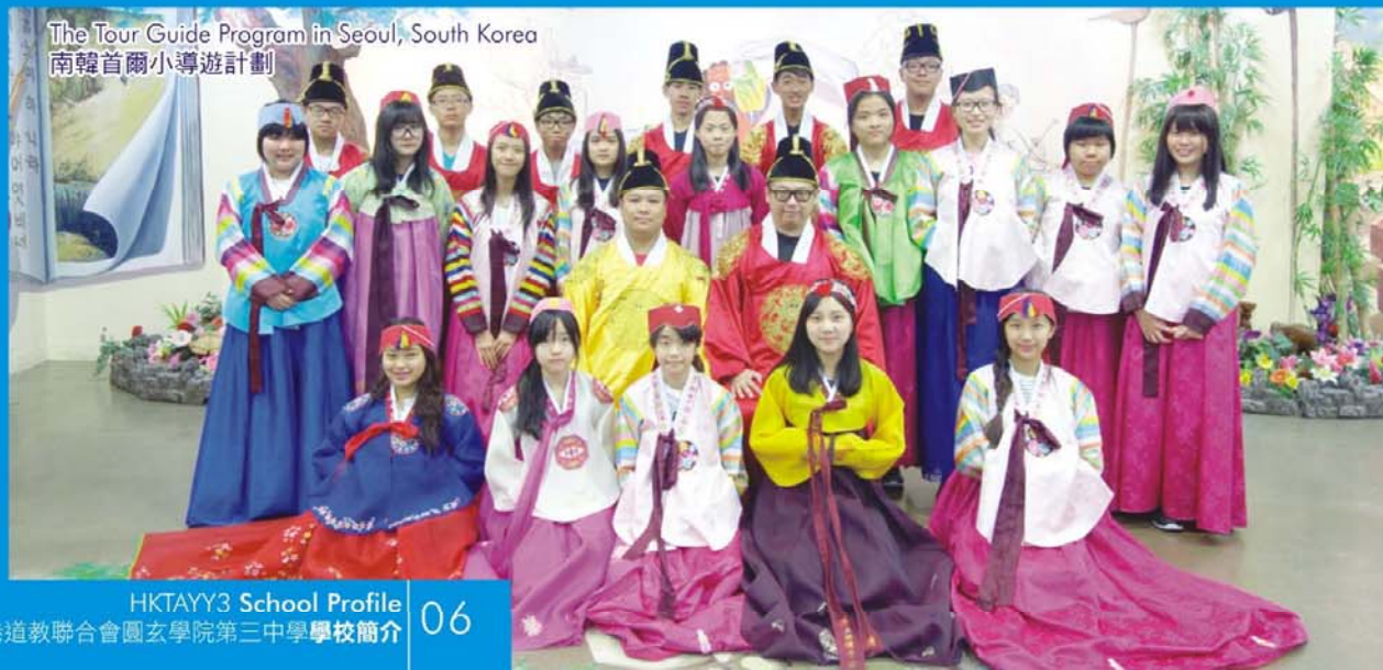
The Tour Guide Program in Seoul, South Korea 南韓首爾小導遊計劃