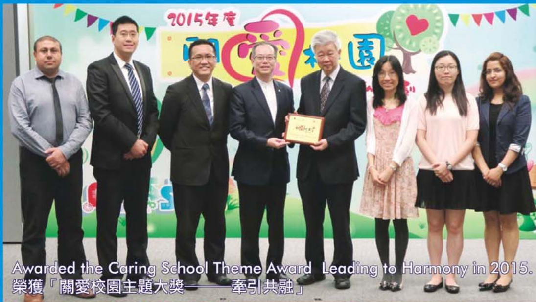
Awarded the Caring School Theme Award Leading to Harmony in 2015. 榮獲「關愛校園主題大獎——牽引共融」