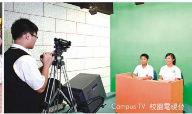
Campus TV 校園電視台

To implement Other Learning Experience under the NSS curriculum and promote extra-curricular activities, an OLE lesson is held every Friday afternoon to help students develop individual interests and talents. Our school offers about 50 teams, clubs and activities for students. We have many outstanding clubs and teams like Juggling Club and Band. They were awarded lots of prizes and were interviewed by various media and press. Different clubs and teams had been invited by various organizations and primary schools to perform and serve. It helps to enhance our students' confidence and communication skills.