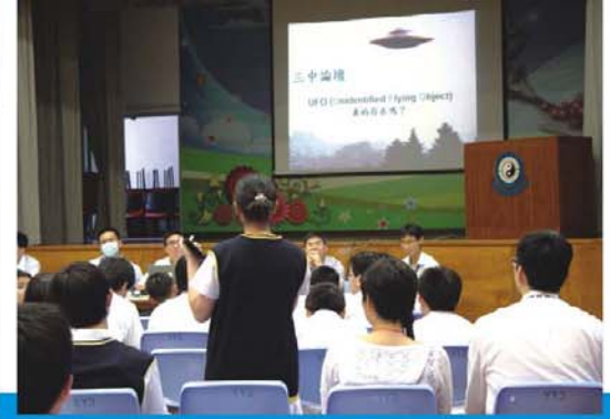
Student-Teacher Forum 師生時事論壇