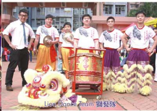
Lion Dance Team 獅藝隊