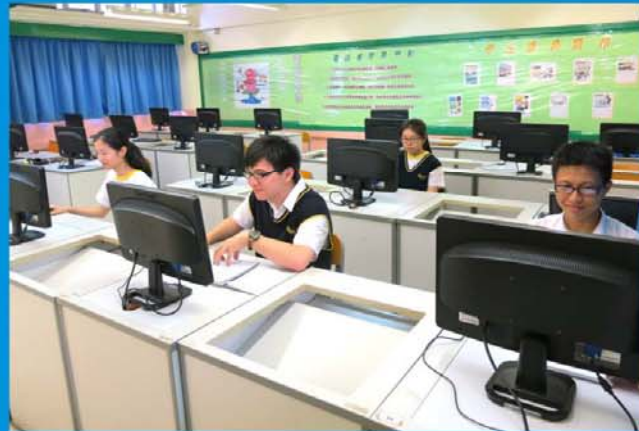
Computer Room 電腦室