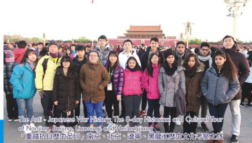
The Anti-Japanese War History: The 8-day Historical and Cultural Tour of Nanjing, Beijing, Liaoning, and Heilongjiang 「重踏抗日歷史足印」南京、北京、遼寧、黑龍江歷史文化考察之旅