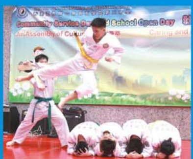
Taekwondo Club 跆拳道