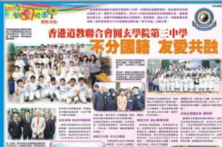
The News of being granted the Theme Award has been reported by Ming Pao 本校獲主題大獎的消息獲《明報》報導