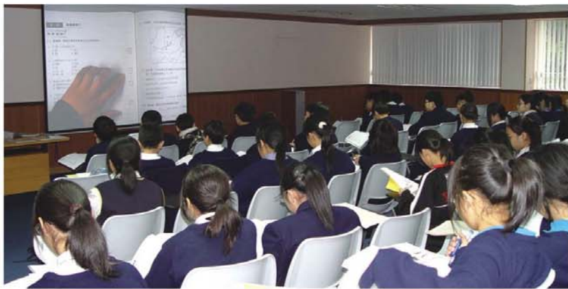
Lecture Theatre 大型演講室