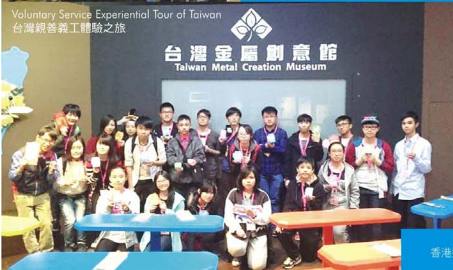
Voluntary Service Experiential Tour of Taiwan 台灣親善義工體驗之旅