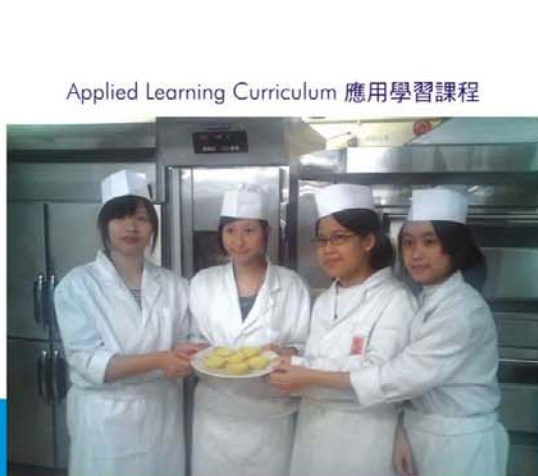
Applied Learning Curriculum 應用學習課程