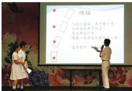
Presenting projects, demonstrating learning outcomes 公開報告展示研習成果