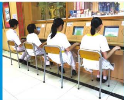
Computer Station 電腦資訊站