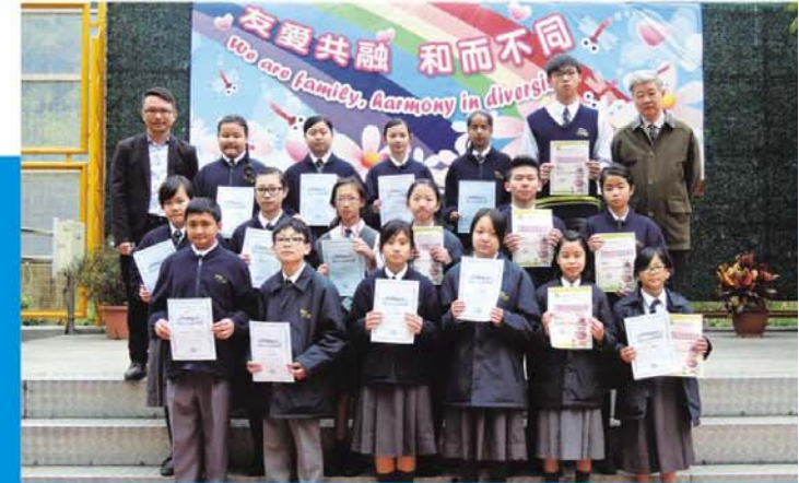
Reading with Fun Programme 悅讀越多FUN計劃