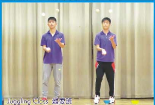
Juggling Class 雜耍班