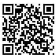
The introduction video of the Theme Award 獲主題大獎的介紹片段