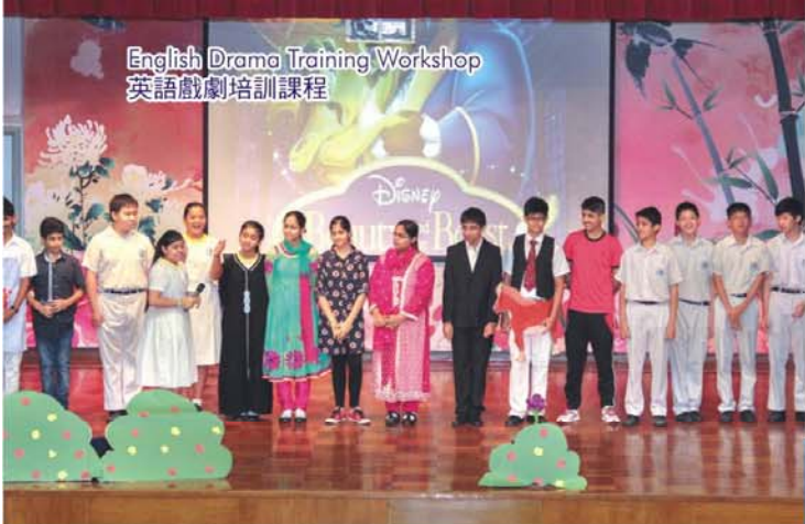
English Drama Training Workshop 英語戲劇培訓課程