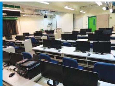
Multi-Media Learning Centre 多媒體學習中心