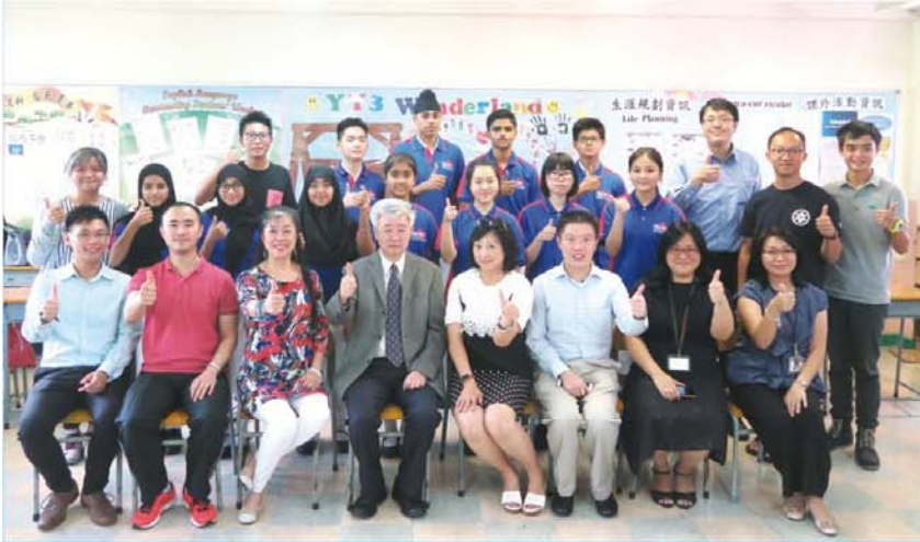
Establishing partnership with the Hong Kong Volunteers Association 與香港志願者協會結成合作伙伴