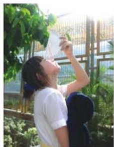
Pythagoras' theorem Workshop 畢氏定理親體驗

自訂課程及編寫教材，透過專題研習活動，有系統地提升中一及中二級同學協作、解難、傳意、分析及自學等能力。