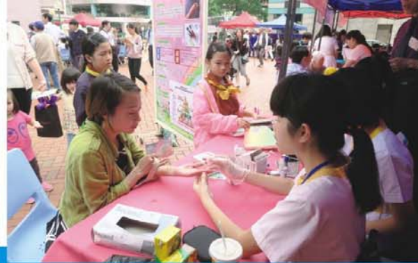
Community Service Day 社區服務日