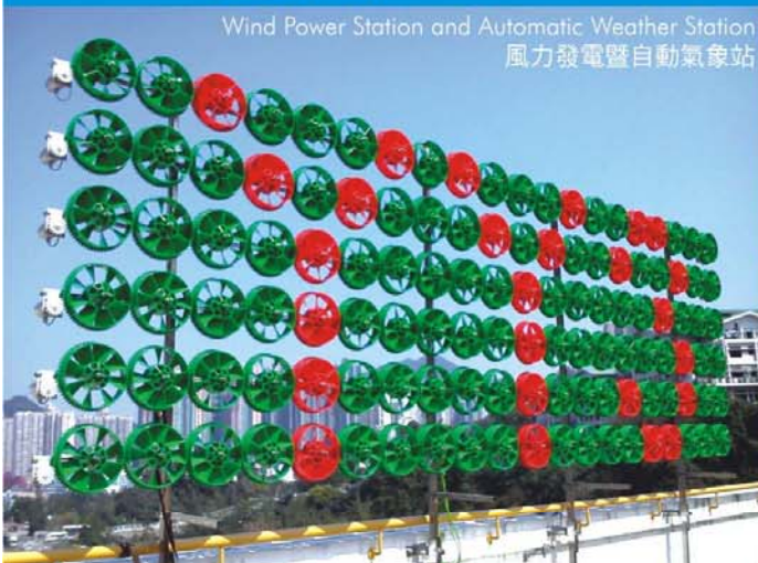
Wind Power Station and Automatic Weather Station 風力發電暨自動氣象站