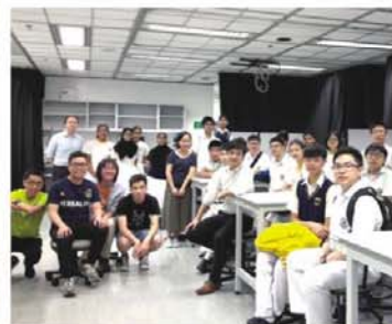
Visit to the School of Science of HKUST 參觀科技大學理學院