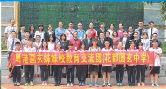
Greeting our Sister School — Guangzhou Huadu Yuen Yuen Secondary School 接待姐妹學校——廣州花都圓玄中學