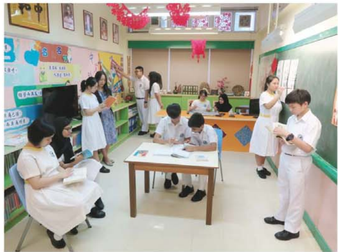
Chinese Corner 中文閣