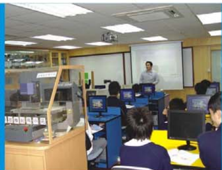
Graphic Design and Technology Room 圖像設計科技創作室