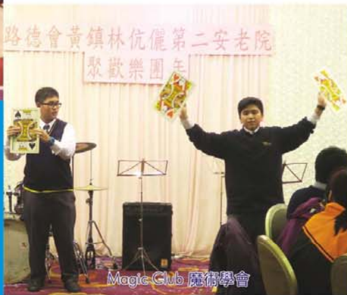
Magic Club 魔術學會

為配合新高中學制下的「其他學習經歷」，全面推行「活動課」，逢星期五下午舉行，讓同學專心發展個人興趣及潛能。全年開設學會及興趣小組近50個。其中如雜耍班、流行樂隊等屢獲殊榮，曾獲多間電子傳媒採訪。各個活動學會及團隊多次獲外間不同機構及小學邀請表演及服務，增加同學自信及與人溝通的技巧。