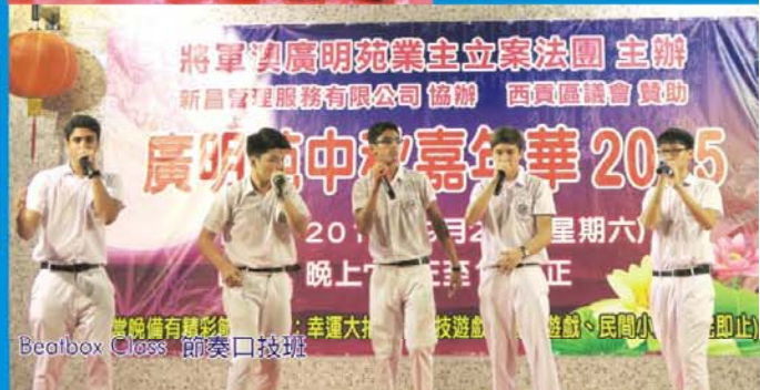
Beatbox Class 節奏口技班