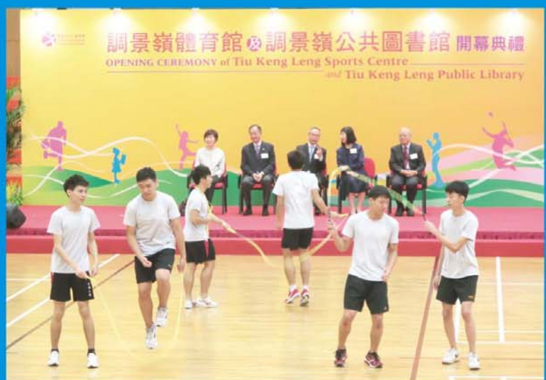
Rope Skipping Team 花式跳繩隊