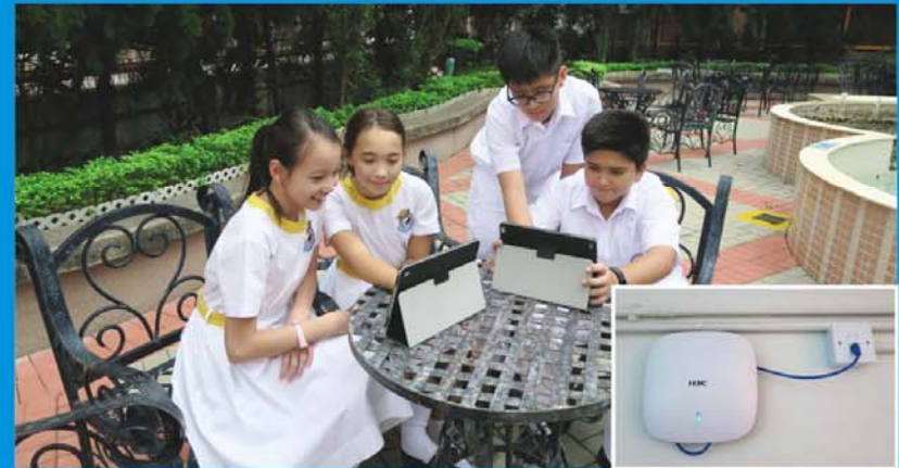
Wireless Network Wi-Fi and Tablet Computers Wi-Fi無線網絡及平板電腦