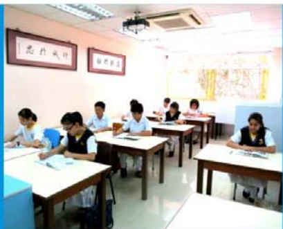
Student Study Room 學生溫習室