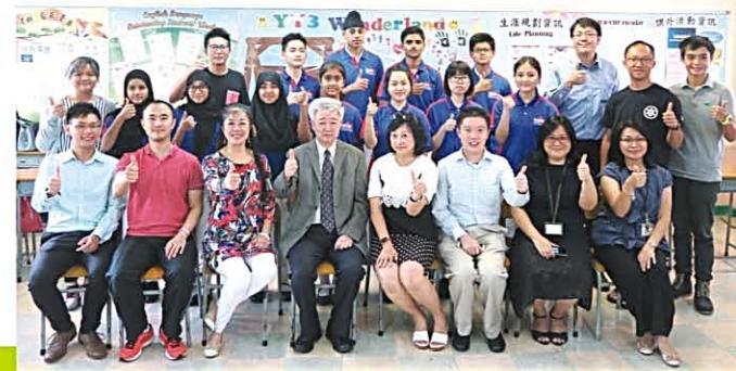
Establishing partnership with the Hong Kong Volunteers Association 與香港志願者協會結成合作伙伴

Social Welfare Department Best Student and Youth Volunteering Projects Champion (Secondary School) 社會福利署最佳學生及青年義工計劃比賽中學組冠軍