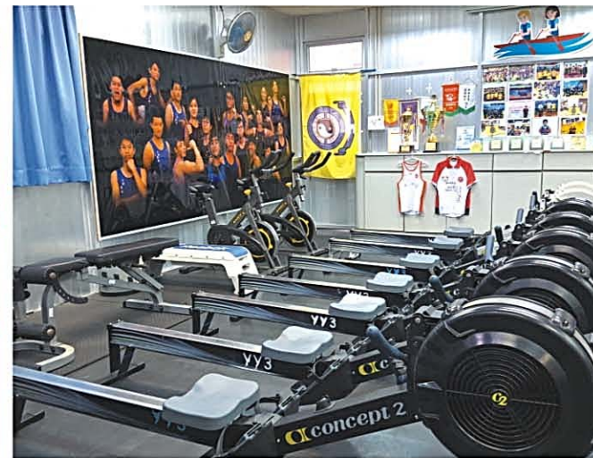
Indoor Rowing Training Centre 室內賽艇訓練中心