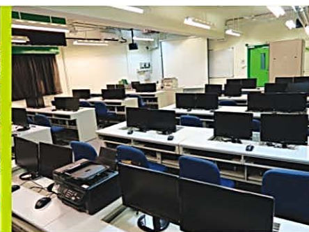
Multi-Media Learning Centre 多媒體學習中心