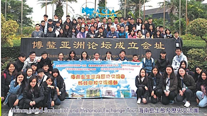
Hainan Island Ecological and Historical Exchange Tour 海南島生態及歷史交流團