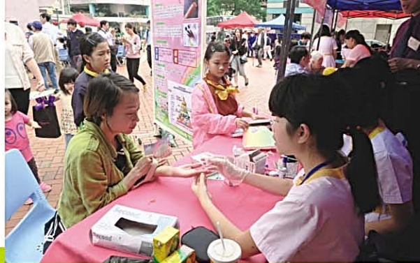
Community Service Day 社區服務日