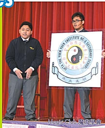
Magic Club 魔術學會

為配合新高中學制下的「其他學習經歷」，全面推行「活動課」，逢星期五下午舉行，讓同學專心發展個人興趣及潛能。全年開設學會及興趣小組近50個。其中如雜耍班、流行樂隊等屢獲殊榮，曾獲多間電子傳媒採訪。各個活動學會及團隊多次獲外間不同機構及小學邀請表演及服務，增加同學自信及與人溝通的技巧。