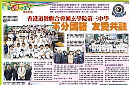
The News of being granted the Theme Award has been reported by Ming Pao 本校獲主題大獎的消息獲《明報》報導