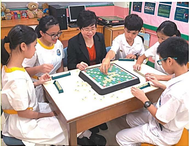
English Corner 英語角