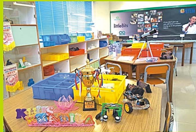
STEM Education Resources Centre STEM教育資源中心