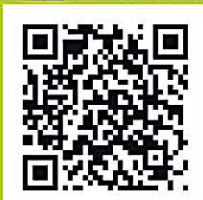
The introduction video of the Theme Award 獲主題大獎的介紹片段