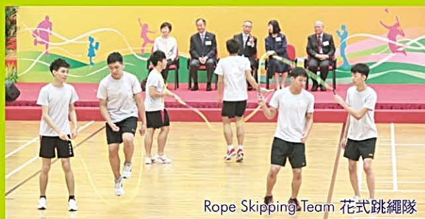
Rope Skipping Team 花式跳繩隊