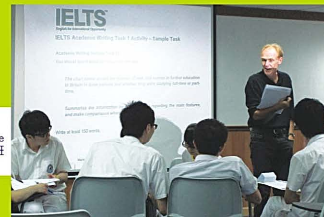
IELTS Training Course 雅思(國際英語水平測試)訓練班