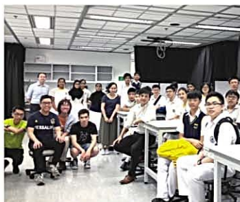
Visit to the School of Science of HKUST 參觀科技大學理學院