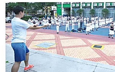
Tai Chi Practice 強身健體太極操