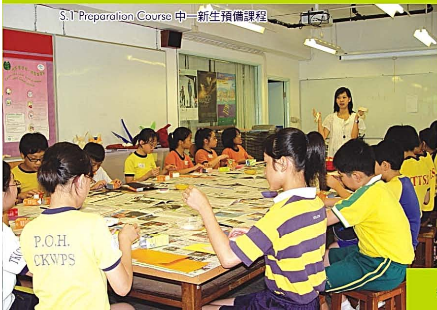
S.1 Preparation Course 中一新生預備課程

每年舉辦多個不同的國內及國外遊學團，如「悉尼之旅」、「英國之旅」、「南韓之旅」、「馬來西亞之旅」、「新加坡之旅」、「北京之旅」、「海南之旅」等，擴闊同學視野。