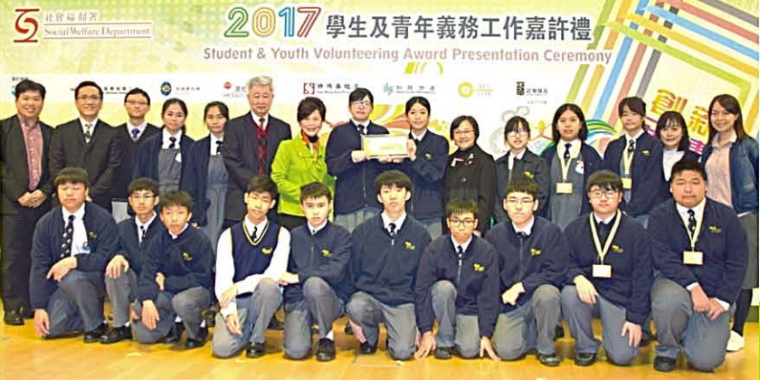
2017 學生及青年義務工作嘉許禮 Student & Youth Volunteering Award Presentation Ceremony