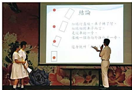
Presenting projects, demonstrating learning outcomes 公開報告展示研習成果

自訂與STEM相關的課程及編寫教材，透過專題研習活動，有系統地提升中一及中二級同學協作、解難、傳意、分析及自學等能力。