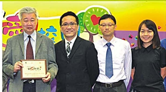
2016年榮獲「生命教育主題大獎優異獎」 Awarded the 'Merit Award of the Caring School Theme Award - Life Education' in 2016