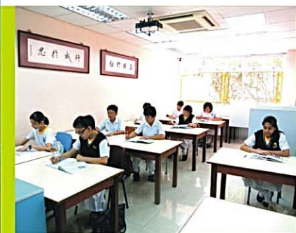
Student Study Room 學生溫習室