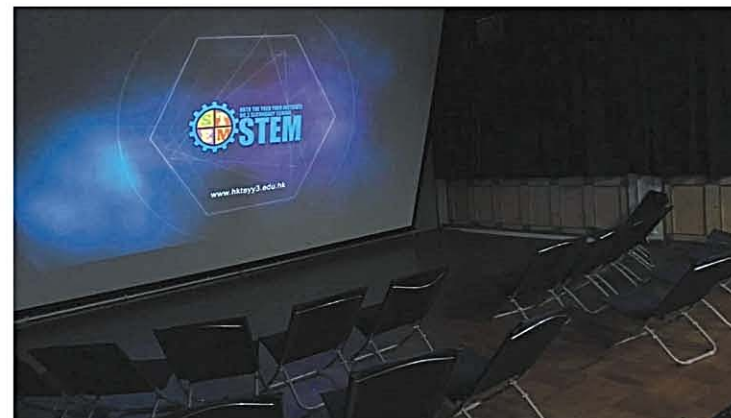
Space Theater 天象影院