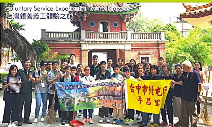
Voluntary Service Experiential Tour of Taiwan 台灣親善義工體驗之旅