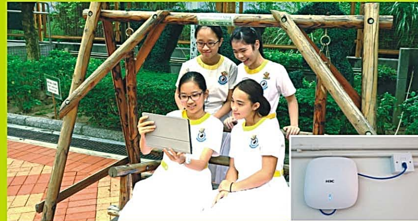
Wireless Network Wi-Fi and Tablet Computers Wi-Fi無線網絡及平板電腦