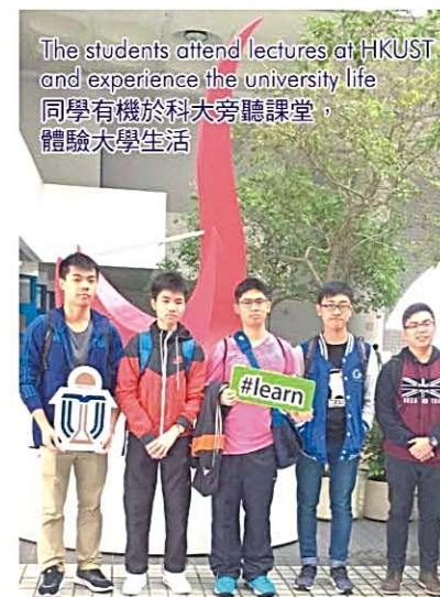
The students attend lectures at HKUST and experience the university life 同學有機於科大旁聽課堂，體驗大學生活