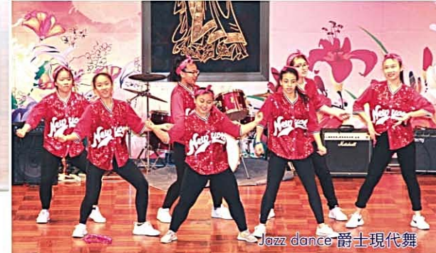
Jazz dance 爵士現代舞

To implement Other Learning Experience under the NSS curriculum and promote extra-curricular activities, an OLE lesson is held every Friday afternoon to help students develop individual interests and talents. Our school offers about 50 teams, clubs and activities for students. We have many outstanding clubs and teams like Juggling Club and Band. They were awarded lots of prizes and were interviewed by various media and press. Different clubs and teams had been invited by various organizations and primary schools to perform and serve. It helps to enhance our students' confidence and communication skills.