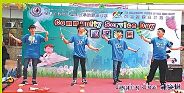
Juggling Class 雜耍班