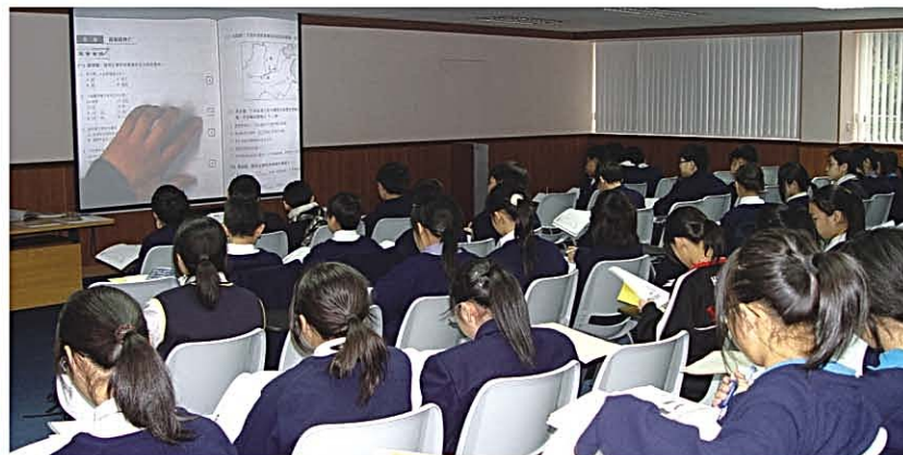
Lecture Theatre 大型演講室