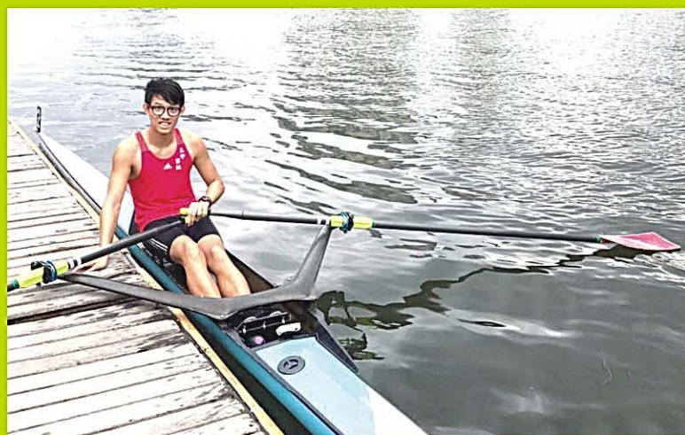
Rowing Team 划艇隊