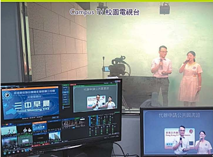
Campus TV 校園電視台