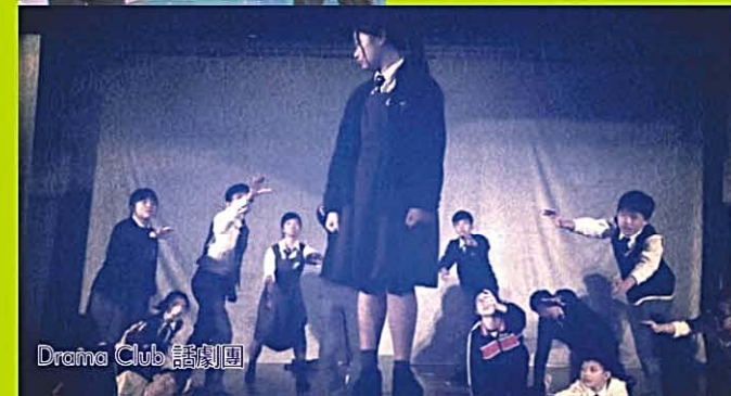
Drama Club 話劇團