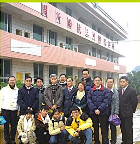
Greeting our Sister School — Guangzhou Huadu YuenYuen Secondary School 接待姐妹學校—— 廣州花都圓玄中學