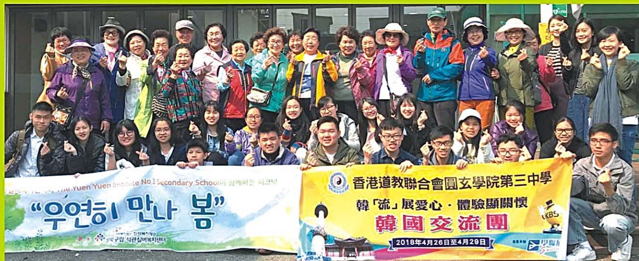
HKTAY3 School Profile 香港道教聯合會圓玄學院第三中學學校簡介