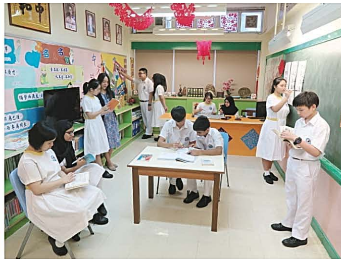
Chinese Corner 中文閣