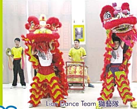
Lion Dance Team 獅藝隊