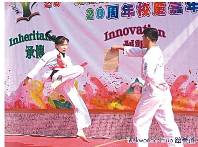
Taekwondo Club 跆拳道