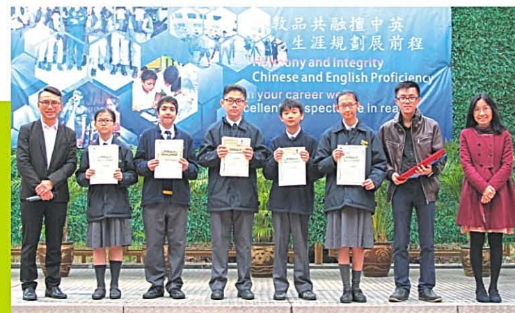
Reading with Fun Programme 悅讀越多FUN計劃