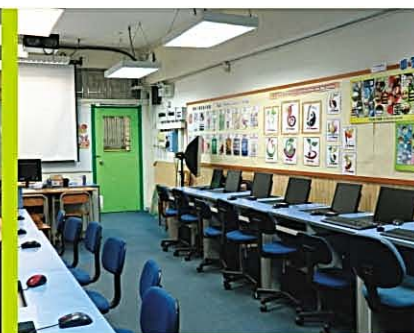
Computerized Art Room 電腦美術創作室