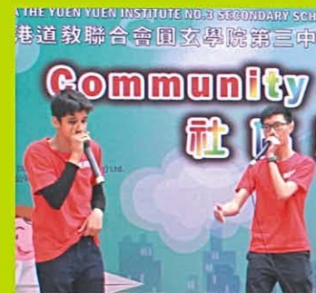
Beatbox Class 節奏口技班