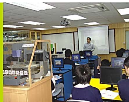
Graphic Design and Technology Room 圖像設計科技創作室