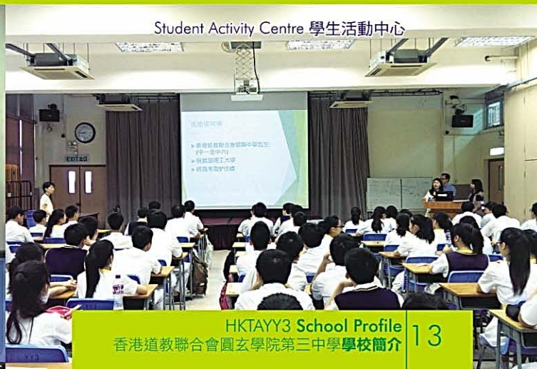
Student Activity Centre 學生活動中心