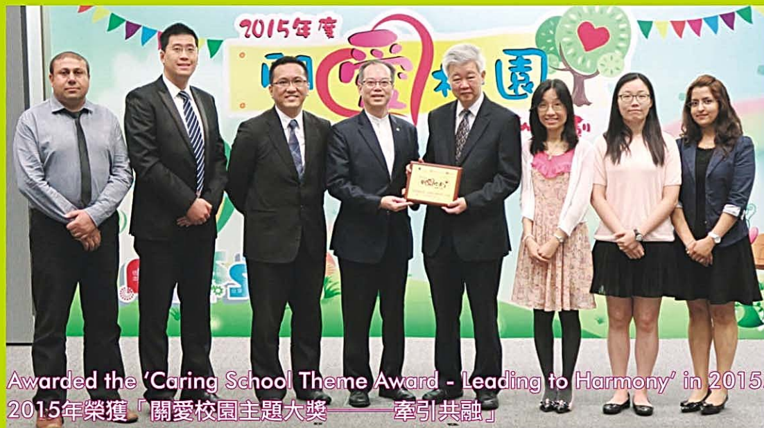
Awarded the 'Caring School Theme Award - Leading to Harmony' in 2015. 2015年榮獲「關愛校園主題大獎——牽引共融」