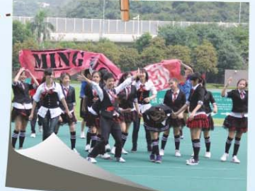
The Sports Day Cheering team of the year goes to "Ming House"!! Congratulations!!! 今年陸運會啦啦隊的冠軍是：明社！「好嘢！」