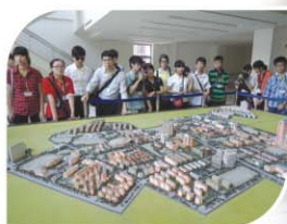
Fu Dan University is so huge! It's simply amazing when looking at the model only! 復旦大學極具規模，單單觀看模型也叫人驚訝。