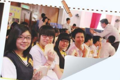
Poverty is not necessarily depressing, having bread can also be fun. We joined the "Poor and Rich" meal for charity. 貧窮不一定愁眉苦臉，吃麵包也可以好開心，參加貧富宴全為慈善。