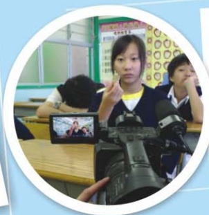
Student actors concentrated in performing their roles at their best. 學生演員專注投入角色。