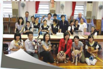
Teachers and students developed their care for pets by attending the "Favourite Pet" competition. 關愛從小動物開始，師生帶同寵物出席「我最喜愛寵物大賽」。