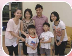
Meeting the Host Family