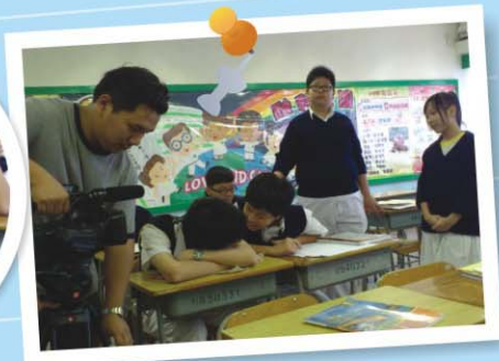
Drama students can still be at ease before the camera. 劇團學生成員面對鏡頭仍然心態自若。