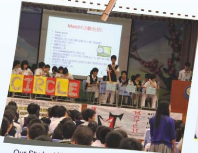
Our Student Union election candidates competed with each other on their proposals and wit for the Student Union Election. 學生會選舉論壇，比拼政綱，也比拼口才，看誰是下屆會長。