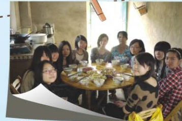
Nan Ning in Guangxi is never a rich place. Only by visiting the place ourselves can we know more about our country. 廣西南寧並非富裕，親自到農家探訪，才能對祖國有更深的了解。