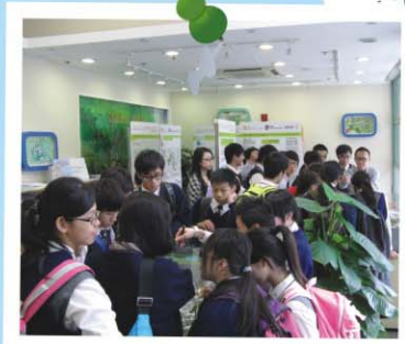
Students at the Urban Re-development Council (Kwun Tong) after they have visited a model of redevelopment of Kwun Tong

觀塘市區發展已經歷數十年，但當中仍然存在不少舊區常見的社會問題，例如環境衛生欠佳、交通擠塞、康樂設施不足等。