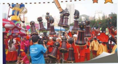
We had fun making a big show in the Standard Chartered Carnival Parade. 搖「槓」吶喊，扮鬼扮馬，齊齊參與渣打藝趣嘉年華巡遊表演。