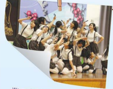
We must all remember this scene where our jazz student showcased their rare talents. 大家一定記得這畫面，爵士舞經常表演，今年她們大顯「女探」本色。