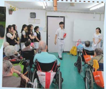
Our students became "little social workers" and brought along with them fun and joy to our senior citizens in the Elderly Home. 同學化身成「北斗星」（社工），探訪安老院，為老友記帶來歡笑。