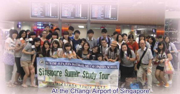
At the Changi Airport of Singapore