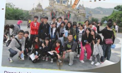
Disneyland is not only a place for fun, joining the career workshop can also be another great experience! 到迪士尼不一定只是玩樂，參與「工作體驗坊」是另類經驗。