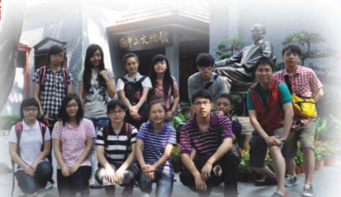
Dr. Sun left his footprints all over the world and the house in Shanghai was a gift for him from his fellow overseas countrymen. 孫中山先生世界各地都留下足跡，上海故居是華僑送贈先生的禮物。

The "Sister School's Shanghai field trip" organized by the Yuen Yuen Institute was held on the 1st-4th of July 2012. The Yuen Yuen Institute No. 1, No.2 and No. 3 Secondary School and Fa Dou Secondary School had a grand total of 48 students and teachers been to Shanghai for exchange. We traced the footsteps of our great poets and politicians in China's modern history, and we learnt a lot about their lives through visiting their residences and where they used to work. We visited the Darroch Road of historical heritages, the residences of great figures like Lu Xun, Dr. and Madame Sun, Zhou En-Lai, the Memorial Hall of the 1st General Assembly of the Chinese Communist Party etc. We had also visited the Fu Dan University and Secondary School where through seminars on their school's history and development, we learnt a lot about our country's education policy. Of course, we had also visited the Oriental Pearl Tower and Shanghai's History Museum, as well as its Tianzifang and Technology Centre, where we get to learn more about Shanghai's past and present with reference to their history, architecture and technological development. Although it is a short trip, we had all really learnt a lot.