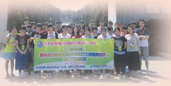
YY3 teachers and students in front of the famous Guangzhou Huanghuagang Park. 三中師生在廣州黃花崗公園下留影。

談到廣州，大部份港人只會想起吃喝玩樂，但是次交流團卻從另一個角度來認識這個既新且舊的城市。我們參觀了華帝燃具有限公司，這公司標誌著我國在生產工業上又向前邁進了一大步。然後，我們參觀了孫中山故居和不同的辛亥革命紀念館，好像進入了一條時光隧道，重走一次革命之路，感受革命英雄為民主獻出寶貴生命的一段血淚史。革命史已成過去，隨之而來的是一片進步與繁榮，但交流團讓同學反思他們在社會中應當如何為自己定位和為社會貢獻。