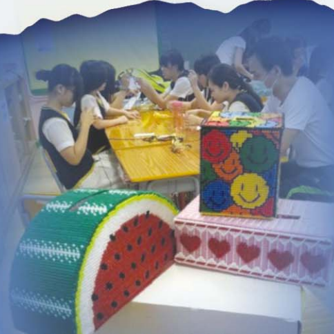
The hard work contributed by both our students and patients recovering from mental illnesses. 三中學生與精神康復者的共同成果。

在活動中，學生對本社區的健康服務資源，以及精神康復者有更深切的認識和了解，而學生也能貢獻所長，服務社區上需要關懷的人士。