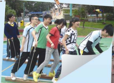
Roars of laughter in Adventure camps!! 同學們在歷奇訓練營中盡情大叫大笑。