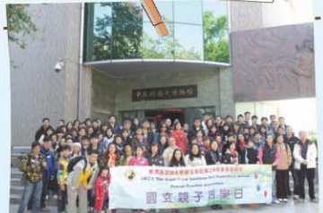
Our PTA Fun Day left Hong Kong for the first time for Shenzhen. What a breakthrough it is! 家教會親子同樂日首次離開香港，北上深圳中英街，真是大突破。