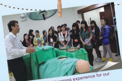
An experiential learning experience for our senior form students in Taiwan! 為新高中學生安排台灣升學體驗團，一眾走進校園，認識台灣大學的課程。