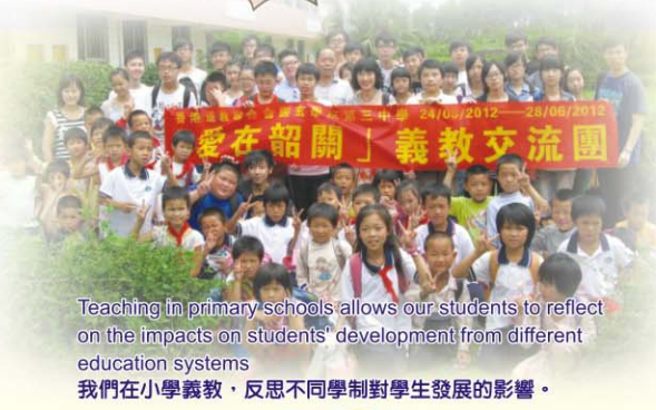
Teaching in primary schools allows our students to reflect on the impacts on students' development from different education systems 我們在小學義教，反思不同學制對學生發展的影響。

為了提倡國民教育，讓同學了解國情，認識祖國，本校公教組於六月二十四至二十八日舉辦「愛在韶關學習交流團」，同學可乘坐高鐵到達廣東省最北面城市韶關。同學探訪農村，在小學義教，藉此交流兩地文化，反思不同學制對學生發展的影響。同時，參觀華南虎野生動物公園、南雄縣恐龍博物館，以及被列為「世界自然遺產」的丹霞山，同學們認識到韶關的生態保育和旅遊業。此外，行程更包括了廣州文化活動，同學們除了參觀大學城科學館及西關博物館外，更到了畔溪酒家體驗老廣州的「飲茶」文化。